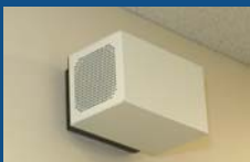
Dual Speaker Design SPKR-11-BD-P

Toll-Free +1 877.724.3387 Direct +1 847.604.9256 FAX +1 847.604.9346